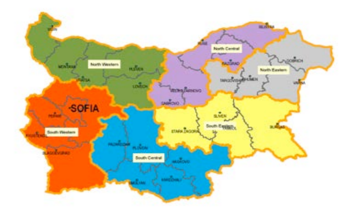
Figure 1: Map of regional level of NUTS2 in Bulgaria

Central region, which includes 5 sub-areas, was selected: Kardjali, Pazardjik, Plovdiv, Smoliyan and Haskovo. The main reason for the selection of this region was the number of small-scale agricultural farms, 27,480 (32% of the total number for the whole country). In the other regions, the average number of small-scale agricultural farms is around 12,000-14,000 (12-14% of the total number for the whole country).